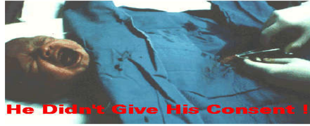
WELCOME TO NOCIRC OF VERMONT

This site will help you better understand circumcision. Circumcision entered American culture about eighty years ago as a cure for specious ailments including masturbation. In the 1930's when quack medical science was found incorrect, the practice was rationalized as a hygienic measure, later as a preventor of various conditions of the penis. It continues largely because many circumcised men have resisted believeing their circumcision in infancy resulted in a loss of sexual functioning and has only "potential" benefits, not realized in most men. Ninety nine percent of men will never need be circumcised. Many better informed men have accepted the distructive nature of circumcision, leaving their own sons intact. Europeans, Canadians and others who once practiced circumcision have largely given it up and their medical professionals have done more to end the mutilation than any in the United States. Circumcision is a 250 million dollar a year industry in the USA. Today the United States is the only nation on earth who circumcises most of its male newborns for non religious excuse.